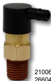
2100614 shown with 2660439 barb cap